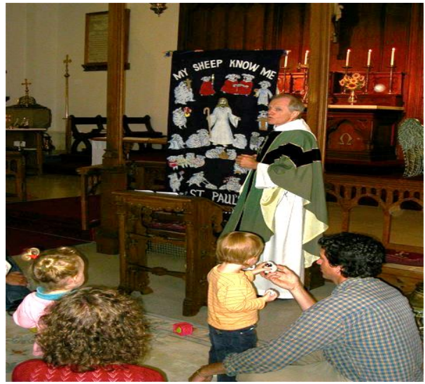
Sunday school 2010