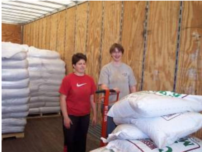
St. Paul's Annual Cocoa Mulch Sale

We are a member of the Episcopal Diocese of Vermont. We have been supported by the Bishop and this diocese in many ways including a deacon, youth education development, and grant monies for congregational development, building repairs and accessibility upgrades. We have participated in retreats, Rock Point Board, Diocesan Council, Diocesan Trustees, Rock Point Summer Conferences, Elderhostel, Annual Convention, Standing Committee and Accessibility Committee.