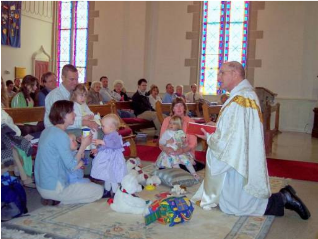
Children's Sermon on Sundays