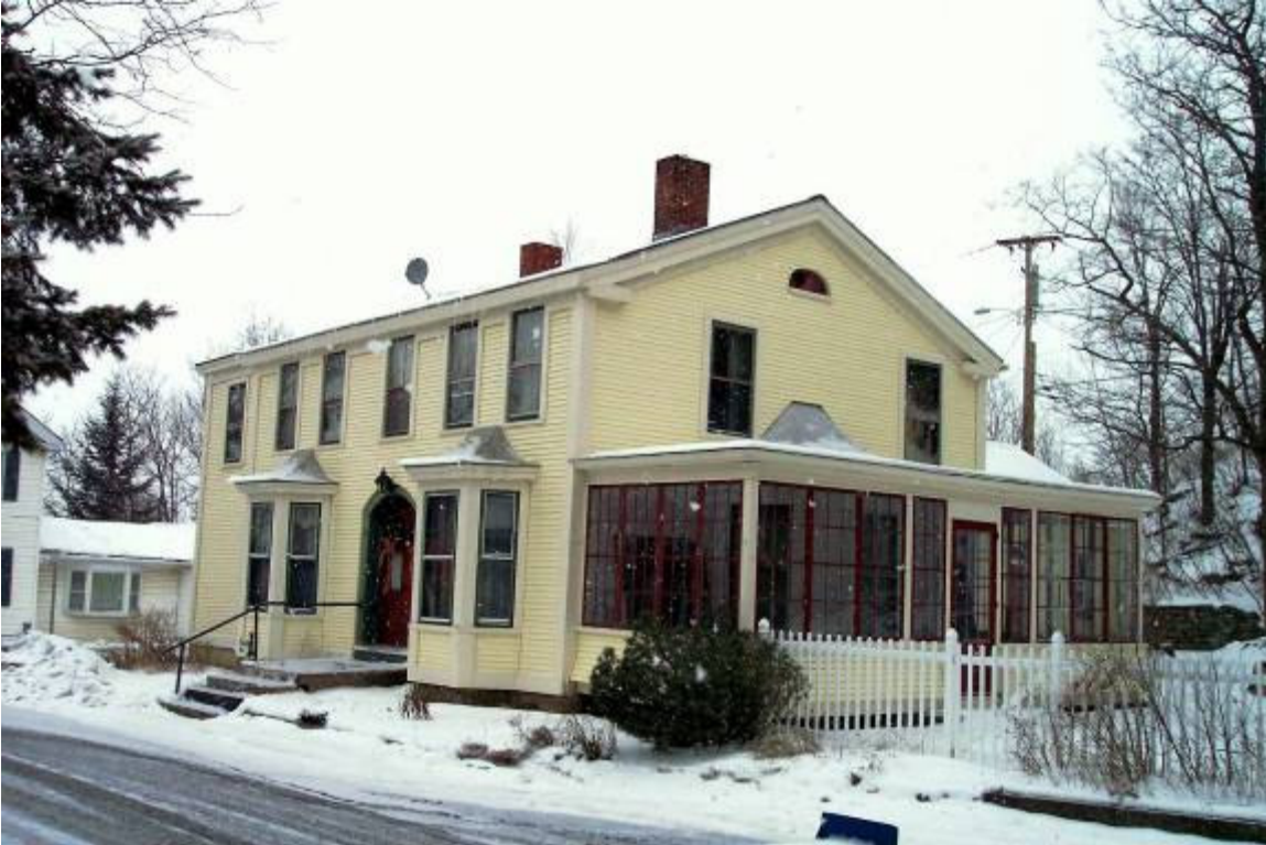
St. Paul's Rectory

parishioners and often provide flowers for the altar. The building is adjacent to the parish hall and faces the city park.