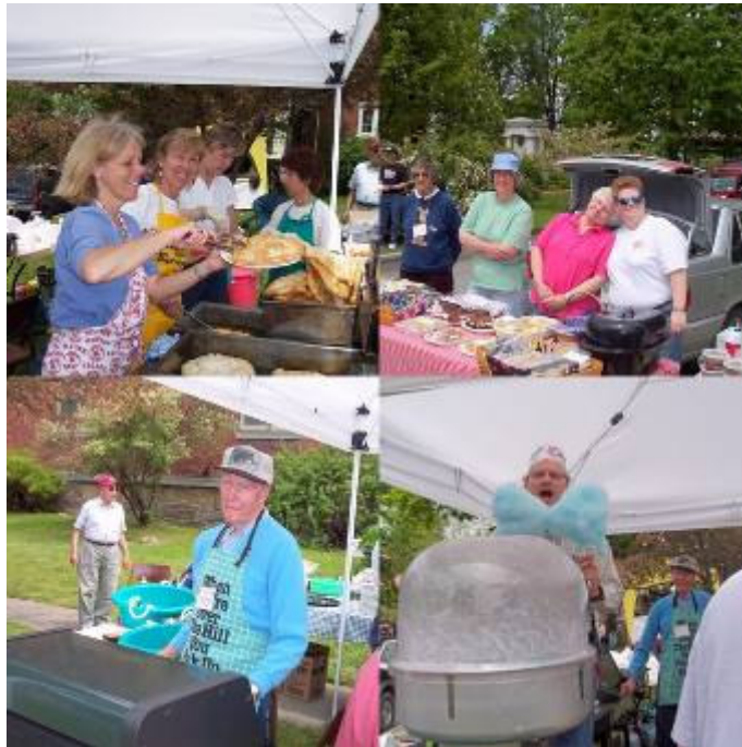
Memorial Day Food Sale

We tithe our income at 5% for local, national and international projects. Annual Cocoa Mulch Sale and Memorial Day food booths also tithe funds for outreach. A recent family walk raised a substantial donation for Episcopal Relief and Development.