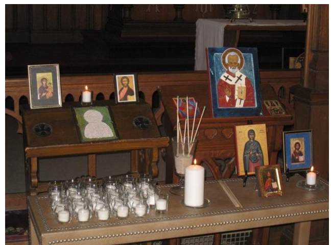
September 18 Taize Service