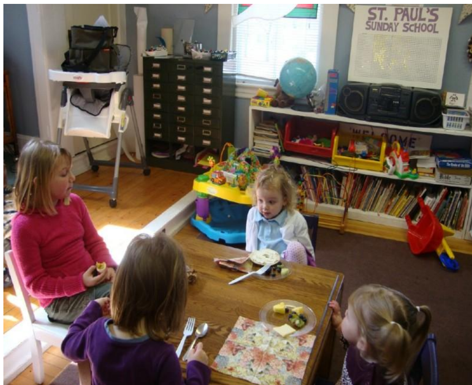
Coffee Hour at St. Paul's