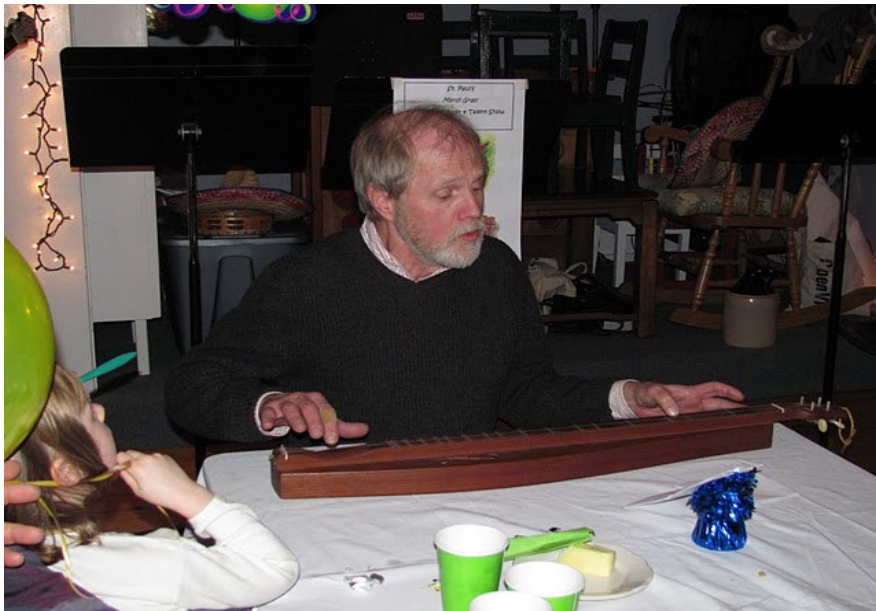
Our rector entertains us.